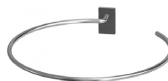
Sharps Container Holder for e.g. USON 21 litre and Jokey container from Mediq

Item no.: JD2660000 Inner Diameter: Ø251 mm Material: Stainless Steel (AISI 304) Surface: Electropolished Height: 50 mm Depth: 295 mm (outer dimension) Thread Diameter: 8 mm Weight: 345 grams MOQ: 5 pcs.