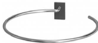
Sharps Container Holder for e.g. USON 11 litres Jokey container from Mediq

Item no.: JD2640000 Inner Diameter: Ø200 mm Material: Stainless Steel (AISI 304) Surface: Electropolished Height: 50 mm Depth: 244 mm (outer dimension) Thread Diameter: 8 mm Weight: 286 grams MOQ: 5 pcs.