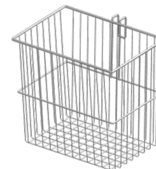
Wire basket 6 litres, conical with hook for T-slot