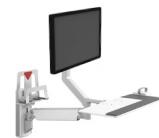
V612-S6XX-11000 12" track, Solo with 20" Height Adjustable Arm, Standard Healthcare Platform and Track Mounted CPU Cradle