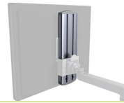
V6 UFEA V600-0000-0060