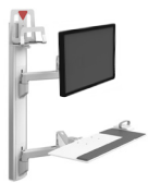
V637-0707-11000 37" track, Two 9" straight arms and 12" adjustable arms for both monitor and keyboard, Standard Healthcare Platform and Track Mounted CPU Cradle