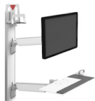
V637-0909-11000 37" track, Two 20" adjustable arms for both monitor and keyboard, Standard Healthcare Platform and Track Mounted CPU Cradle