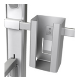
Rail Mounted Glove Box Holder VPA-GB-HLD