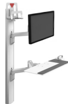
V647-0707-11000 47" track, Two 9" straight arms and 12" adjustable arms for both monitor and keyboard, Standard Healthcare Platform and Track Mounted CPU Cradle