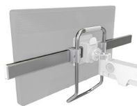
VESA Accessory Rail Mount with 27" Rail VPV-27H