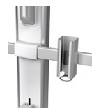
Rail Mounted Hand Sanitizer Holder VPA-HD-SNT