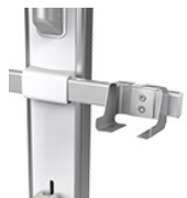
Rail Mounted Scanner Bracket VPA-SC-BKT