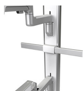
V6 - Accessory Rail Mount with 19" Rail VPV-19