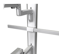
V6 - Accessory Rail Mount with 27" Rail VPV-27