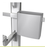
Rail Mounted Chart Holder VPA-CH-HLD