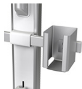
Rail Mounted Sharps Container Holder VPA-S-CNT