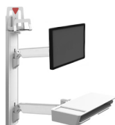
V637-0909-21000 37" track, Two 20" adjustable arms for both monitor and keyboard, Vdesk and Track Mounted CPU Cradle